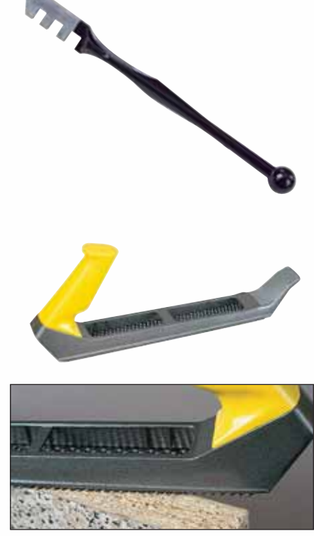
SURFORM® TOOLS CUT, SHAVE, SCRAPE, PLANE, FORM, FILE, SMOOTH, SAND AND FINISH.